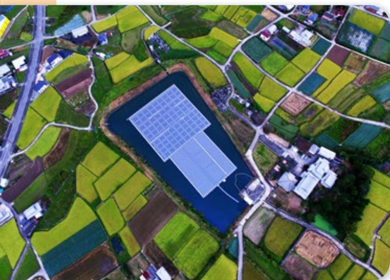
Project : Isawa Ike, Japan