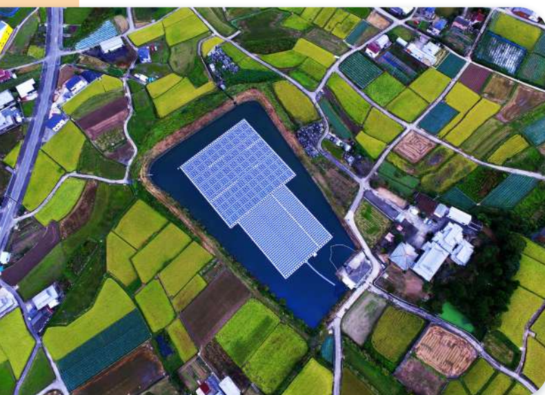
Project : Isawa Ike, Japan