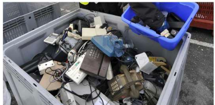
Les citoyens peuvent y déposer imprimantes, claviers, téléphones et autres objets numériques inutilisés, cassés ou simplement obsolètes.