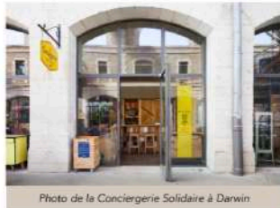
Photo de la Conciergerie Solidaire à Darwin

Laketricity annonce son prochain rendez-vous visant à contribuer à un monde plus propre à travers une collecte de déchets électriques et électroniques durant une semaine à partir du 13 mars. Cette initiative est lancée à l'occasion du Digital Clean Up Day ayant lieu le 18 mars et se tiendra à Darwin, Bordeaux (au niveau de la Conciergerie Solidaire). Elle s'inscrit dans la mission de Laketricity de développer des solutions de production d'énergies renouvelables pour les intégrer durablement dans leur environnement local.