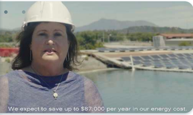
We expect to save up to $87,000 per year in our energy cost.

This floating solar project is the largest in California, and we're very proud of it. We can lead the way and show other municipalities and water agencies what they can do. We expect to save up to $87,000 a year on our energy costs. Up to $4 million over the 25-year power purchase agreement.